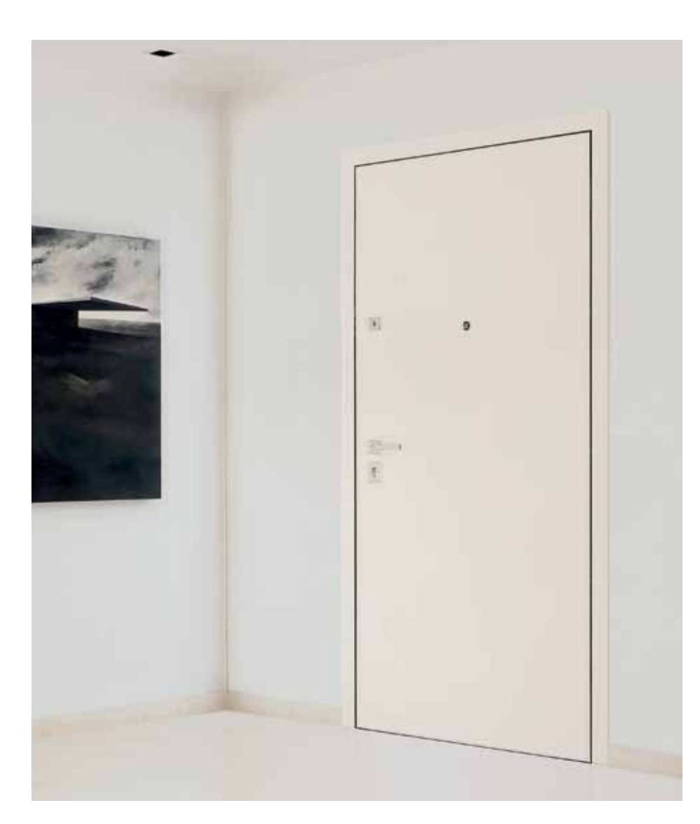
From structurally point of view AXLE is a revolutionary concept. The hidden hinges have horizontal and vertical adjustments.